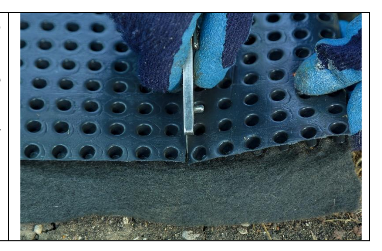
Step 2: Remove the top 4 to 6 inches (6 to 9 dimples) of plastic core exposing the fabric.

Step 1: Lay out drainage board to be installed. 4 to 6 inches (6 to 9 dimples) below what will be the top of the drainage board cut only the plastic core from one side to the other with a utility knife. Do not cut through the fabric.